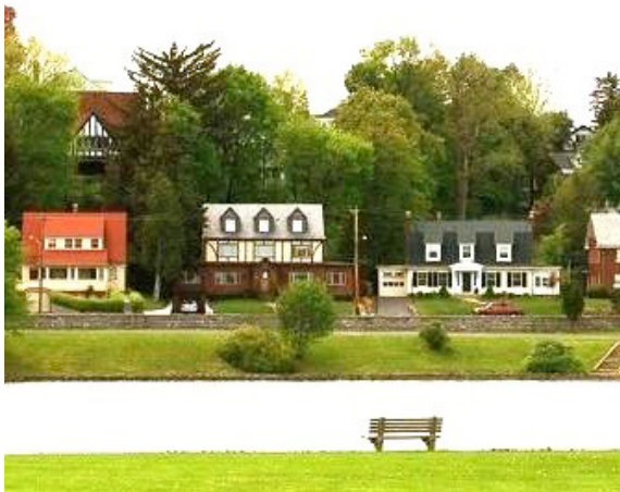
Strathmore neighborhood in Syracuse, NY.