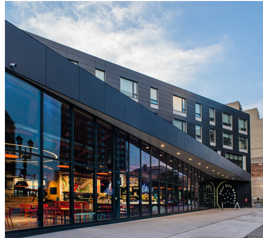
Salt City Market.

Opened in 2020, Salt City Market is a market and food hall that shows off Syracuse's hidden culinary gems. Food hall vendors are local entrepreneurs, each presenting a cuisine from around the world. Current vendors include Baghdad Restaurant, Big in Burma, Cake Bar, Erma's Island Jamaican Restaurant, Firecracker Thai Kitchen, Habiba's Ethiopian Kitchen, Mamma Hai Vietnamese restaurant, and Miss Prissy's Soul Food.