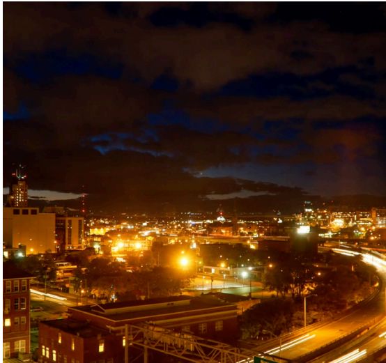
Syracuse downtown evening view.